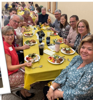
The bell choir joins the chancel choir for a hymn during worship. Many enjoyed the food, fellowship and memories shared during the luncheon.